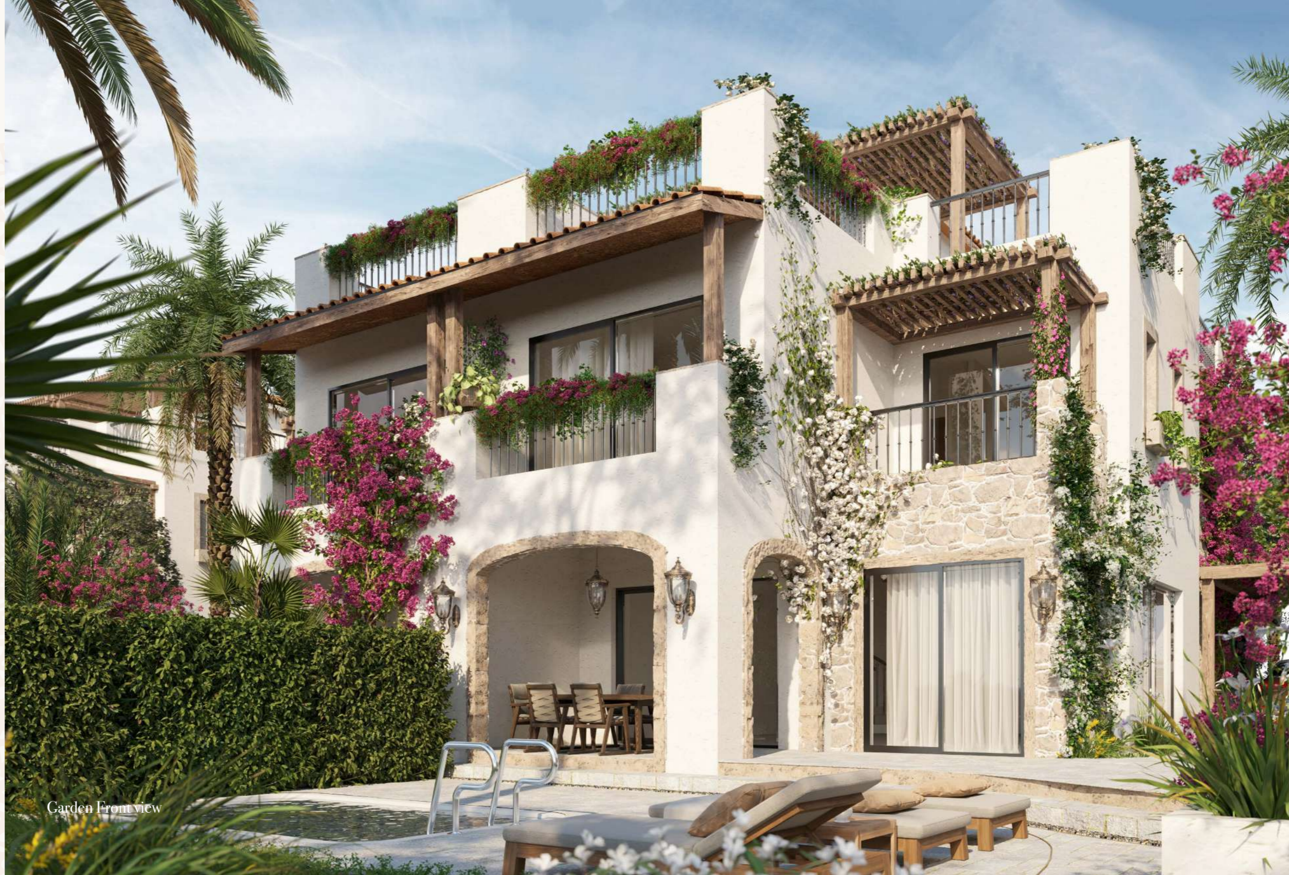
Garden Front view

Each villa honors Italy's rich maritime tradition, providing a luxurious and refined retreat that embodies the essence of these iconic coastal destinations.