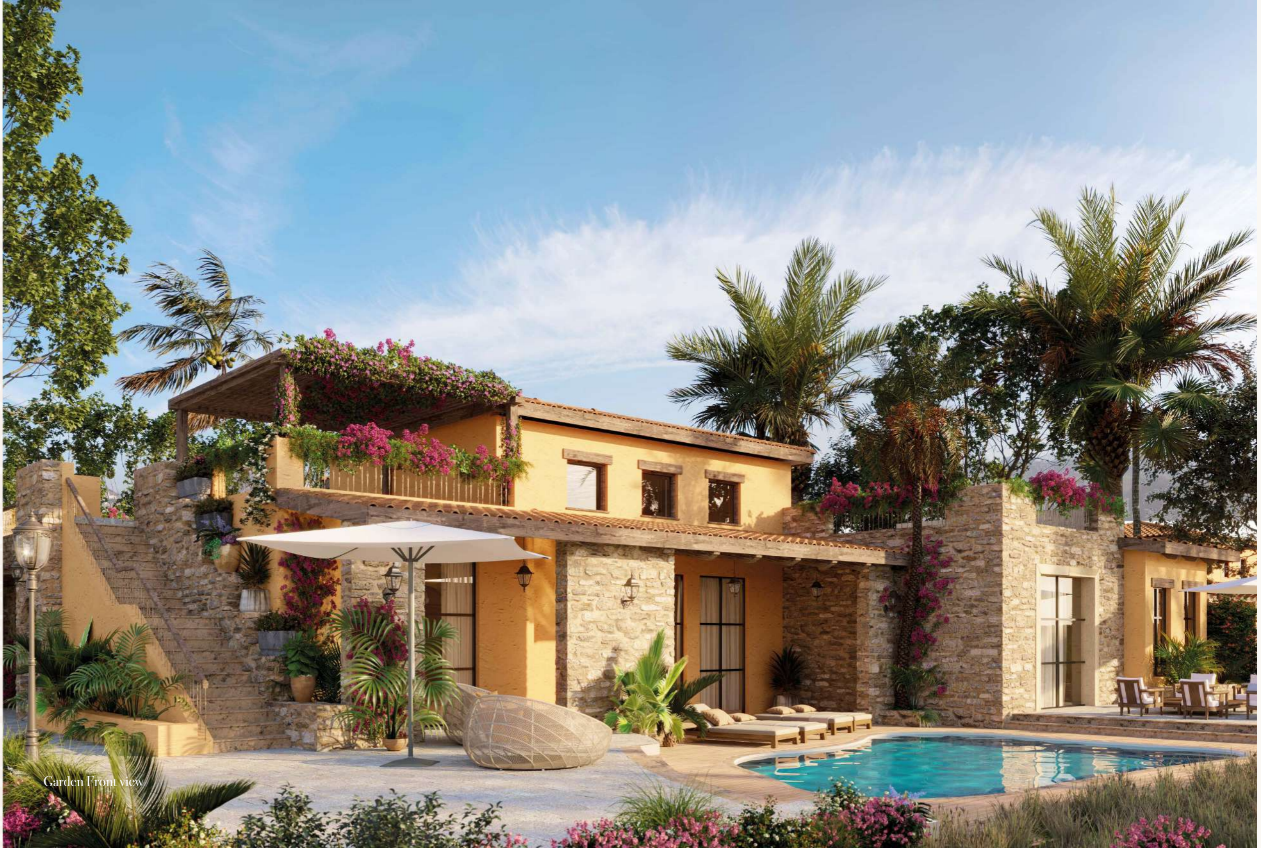
Garden Front view

Each villa honors Italy's rich maritime tradition, providing a luxurious and refined retreat that embodies the essence of these iconic coastal destinations.